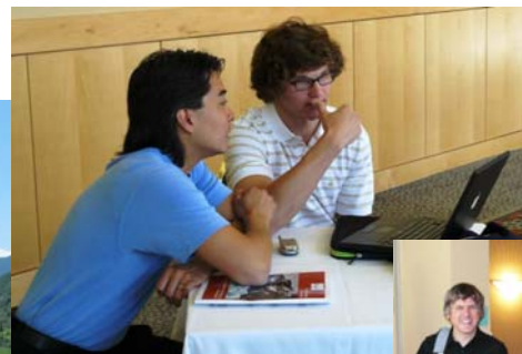
Professor & Student Working Hard