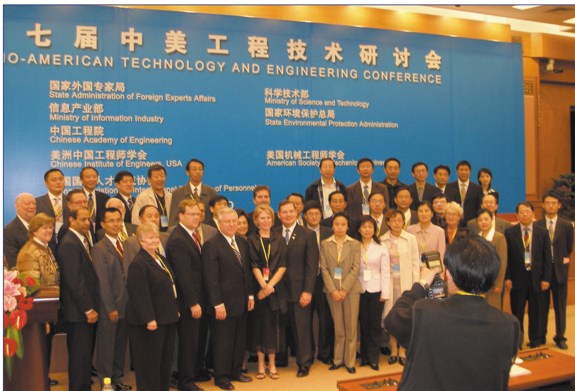
SATEC participants pictured in the Great Hall of China

There was intense interest in improving quality, efficiency, and gaining technology for a future soon arriving of self sufficiency in a changing competitive landscape. While there is a ways to go, several of our visited companies clearly were well positioned and had a healthy improvement glidepath to become world class enterprises. Interestingly, one of the most common questions received was how Chinese companies can better work with U.S. companies – including finding U.S. suppliers for products difficult to source in Asia. ▼