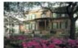
Owens Thomas House—Savannah, GA