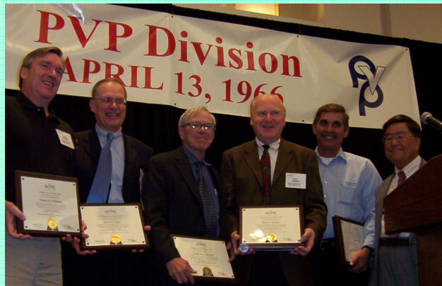
Developers of Tutorials Sessions Recognized at the Honors Luncheon.

"Climate good. Very good conference environment. The wife is happy."