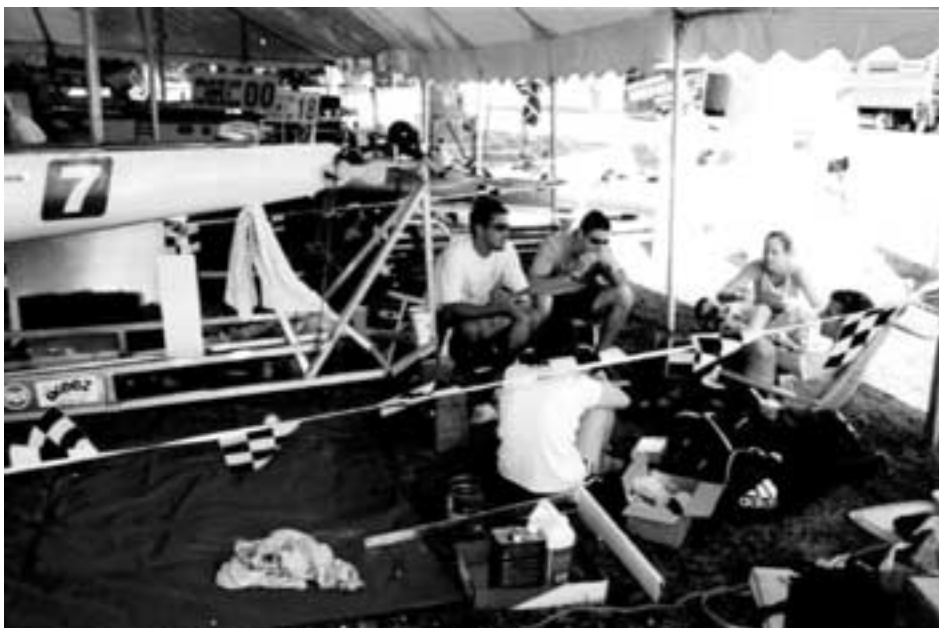
A large paddock area is created using a 60' x 90' tent. Power is provided and each team has an assigned 10' x 30' area that is their 'home' for the five days of Solar Splash. The veteran teams come well prepared. Some have their own trailers with mini-workshops. Most have come to realize that there is more to success than just boat preparation, it is attention to all the details.

Sportsmanship has always been a key aspect of the Splash and this was apparent again when UMass-Dartmouth loaned Coast Guard it's solar panels for the Endurance after the USCG panels proved inadequate. Also, the loan of the rudder to South Carolina by the Coast Guard was instrumental in determining the final standings. Although wind was a bit troublesome for some of the teams, it also added an element of reality. Solar Splash is not just an academic exercise; it takes place in the real world with very real challenges.