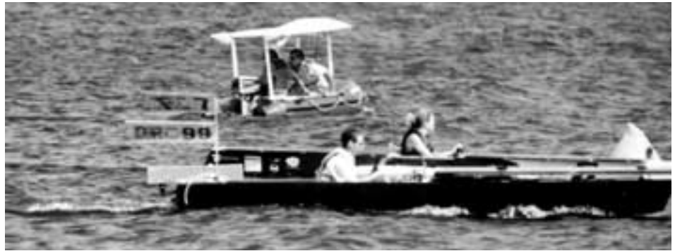
Kansas State University, using boat sign #99, passes the College of New Jersey at one of the corner marks. One of the two safety patrol boats can be seen in the background. A team of judges does lap counting in the same manner used for the Indy 500 for many years.

Our hosts, the University of New Orleans won the Sprint, but this didn't distance them from their close rivals since